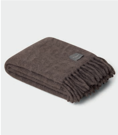
4108 Luxury Kid Mohair Blanket Charcoal