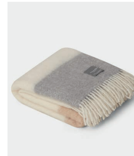
4164 Mohair Blanket Camel & Skiffer Stripe