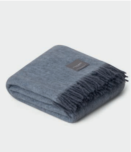
4140 Mohair Blanket Tide & Blue Fog Melange