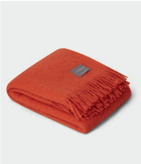
4166 Mohair Blanket Jaffa Orange