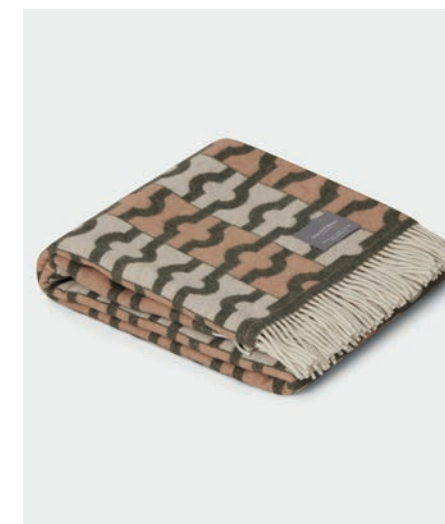
9117 Wallpaper Blanket Beige, Moss & Offwhite