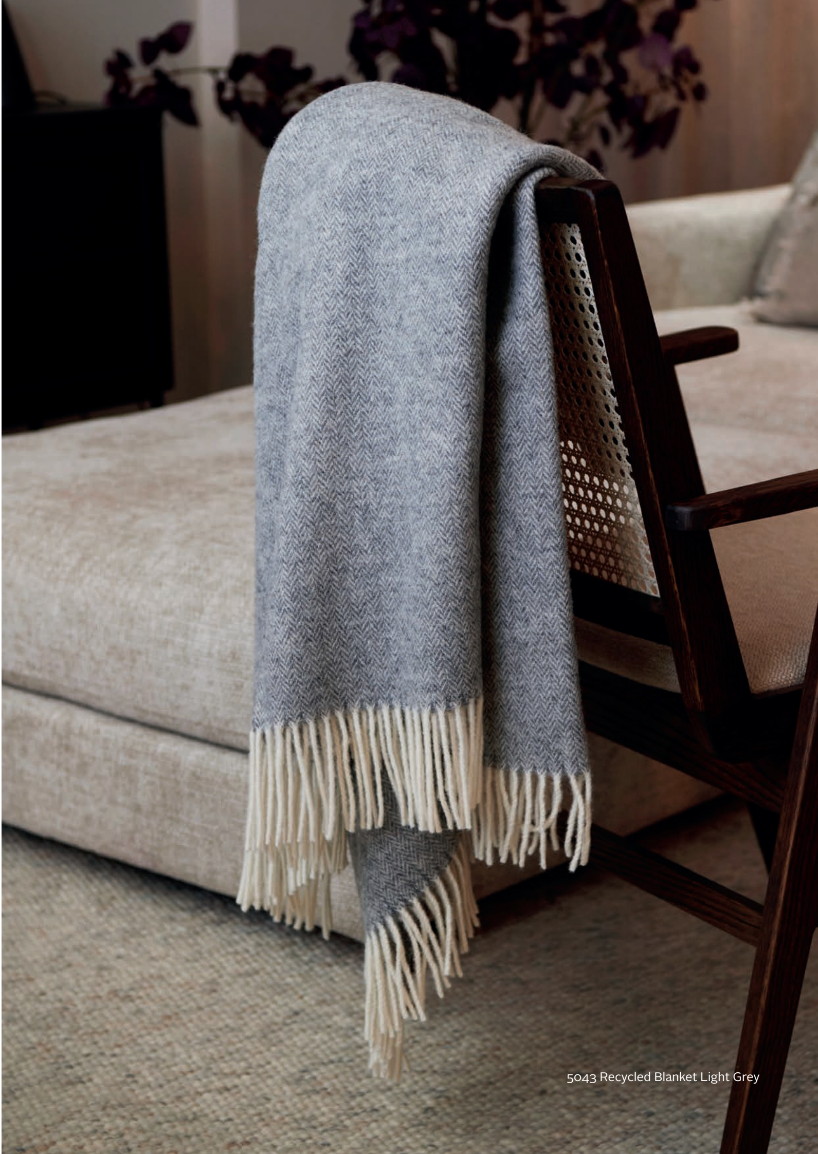
5043 Recycled Blanket Light Grey