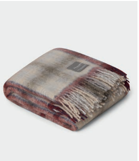
4165 Mohair Blanket Camel, Beige Fired Check