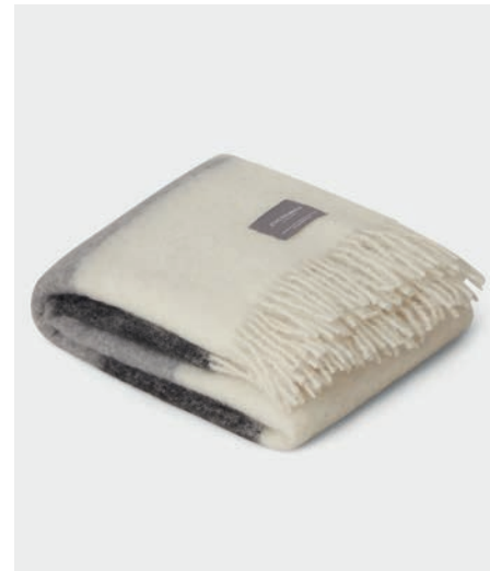
4172 Mohair Blanket Black, Skiffer & White Stripe