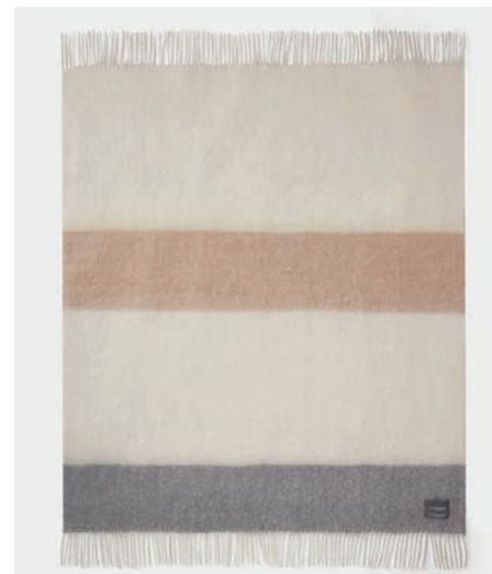
4164 Mohair Blanket Camel & Skiffer Stripe Pattern