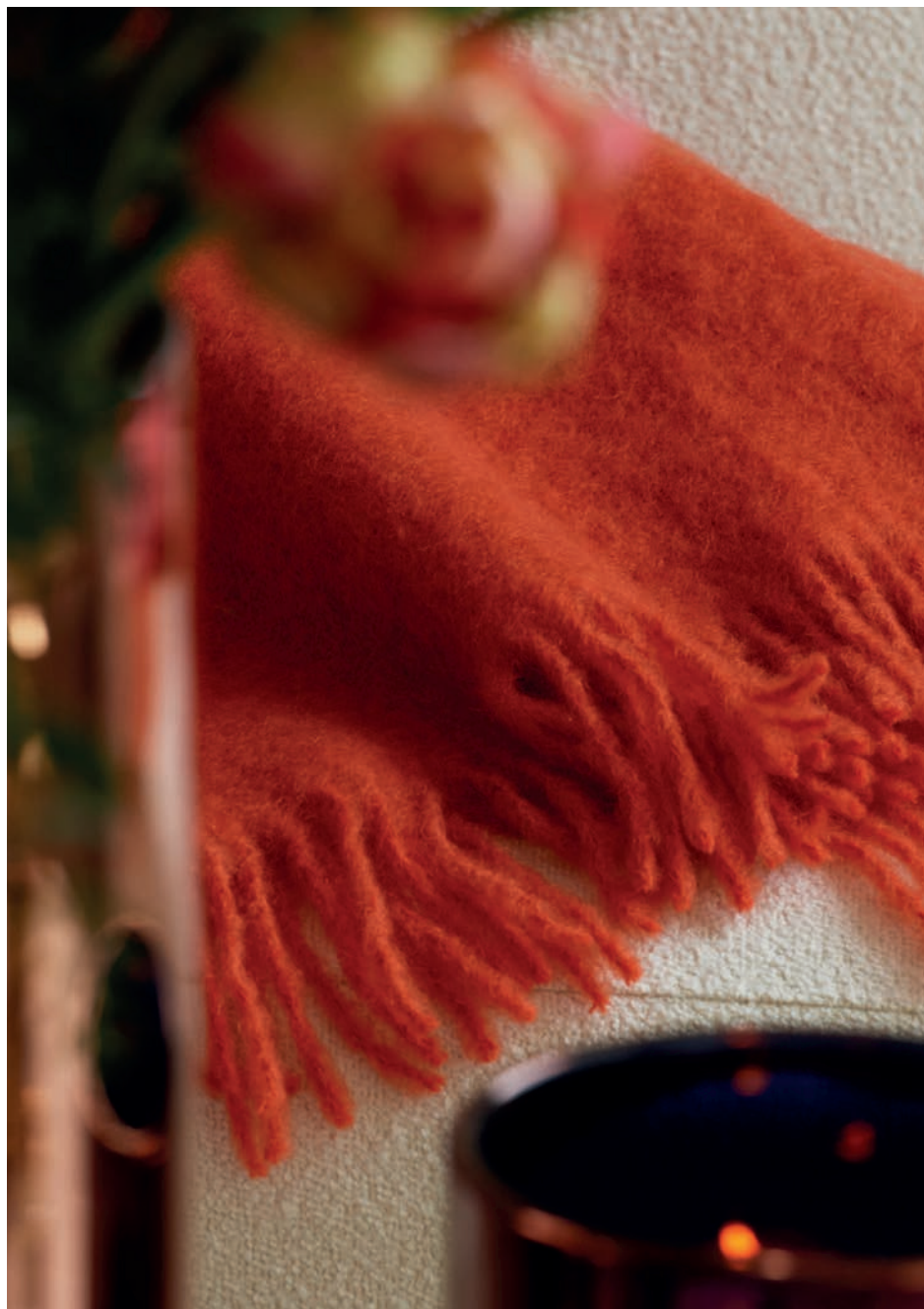
Cover: Cover 4168 Ochra Above: 4166 Mohair Blanket Jaffa Orange