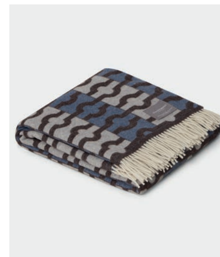
9118 Wallpaper Blanket Blue, Brown & Offwhite