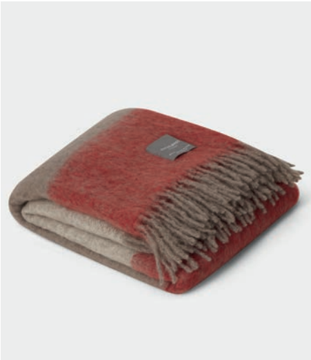
4154 Mohair Blanket Brick & Brindle Stripe