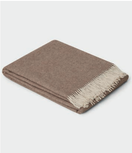
5044 Recycled Blanket Beige