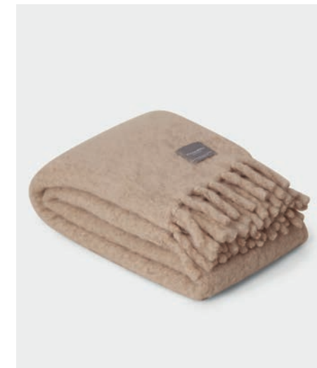
4202 Mohair Deluxe Blanket Sand