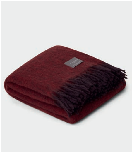
4149 Mohair Blanket Aubergine & Fired Earth Melange