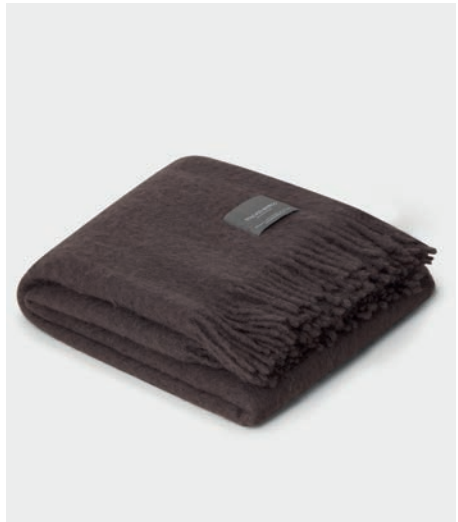
4151 Mohair Blanket Charcoal