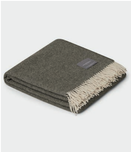
5041 Recycled Blanket Green