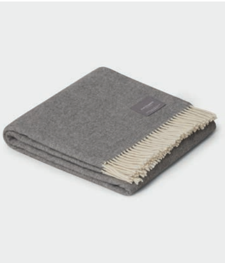
5043 Recycled Blanket Light Grey