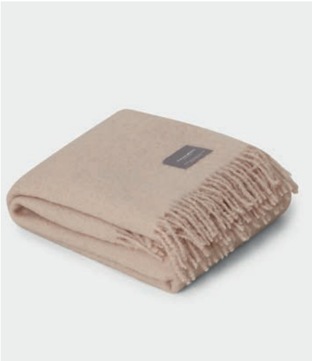
4071 Mohair Blanket Portabello