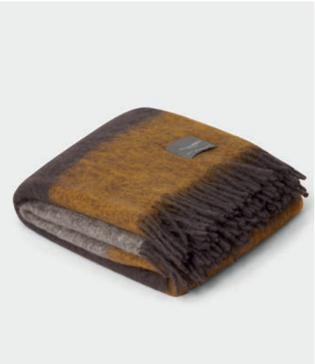
4155 Mohair Blanket Mustard & Charcoal Stripe

If you use your plaid frequently, the brushed fibers may shrink slightly after a while. You can then very easily get it almost like new by using a regular clothes brush and brushing it up again. Should you happen to get a stain on your plaid, you can easily remove it with a damp cloth and mild detergent. We do not recommend that you wash your plaid, but instead it should be aired. If, against all odds, you need to wash the plaid, it should always be dry-cleaned.