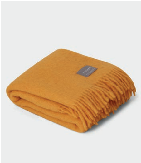
4168 Mohair Blanket Ochra