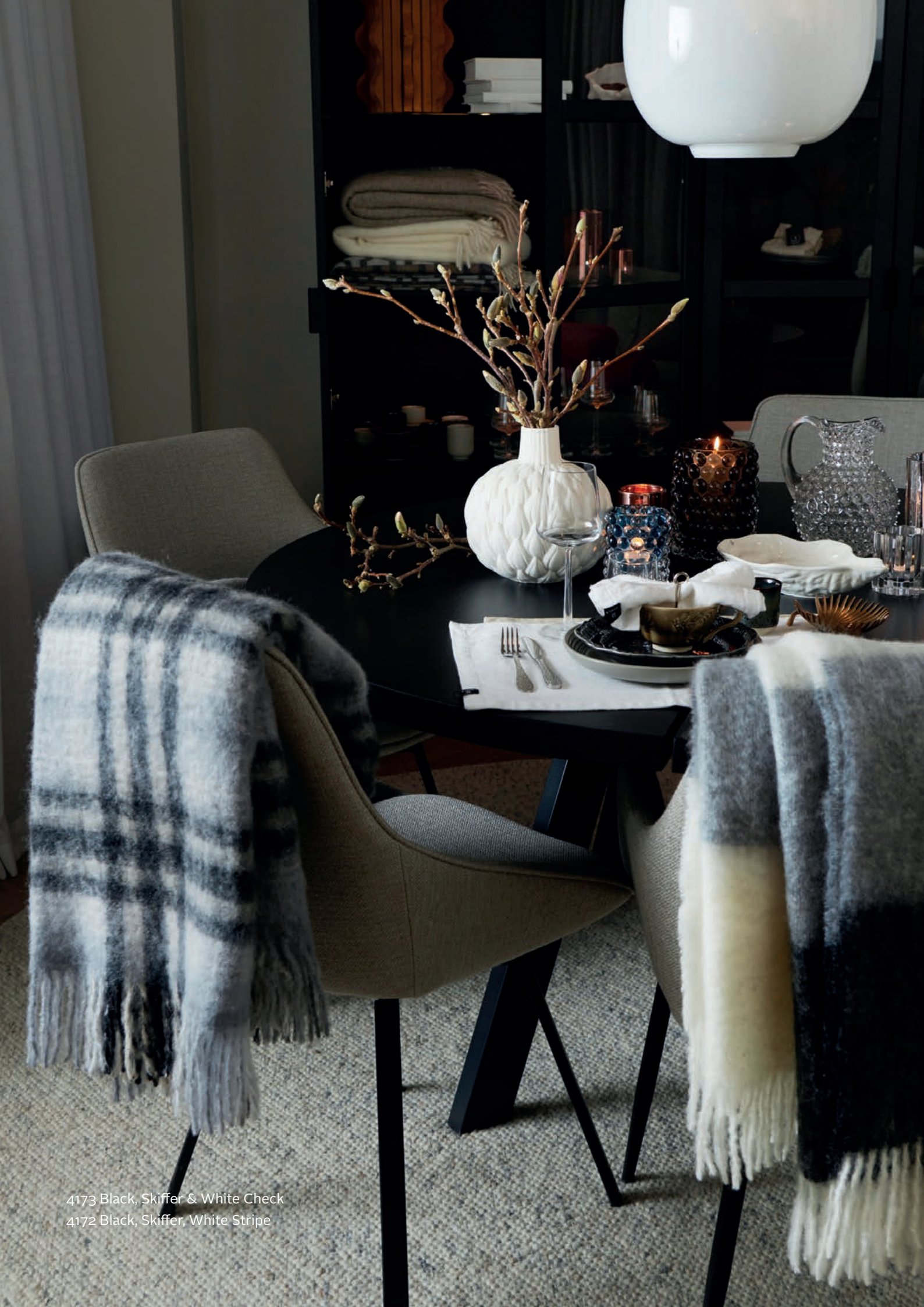
4173 Black, Skiffer & White Check 4172 Black, Skiffer, White Stripe