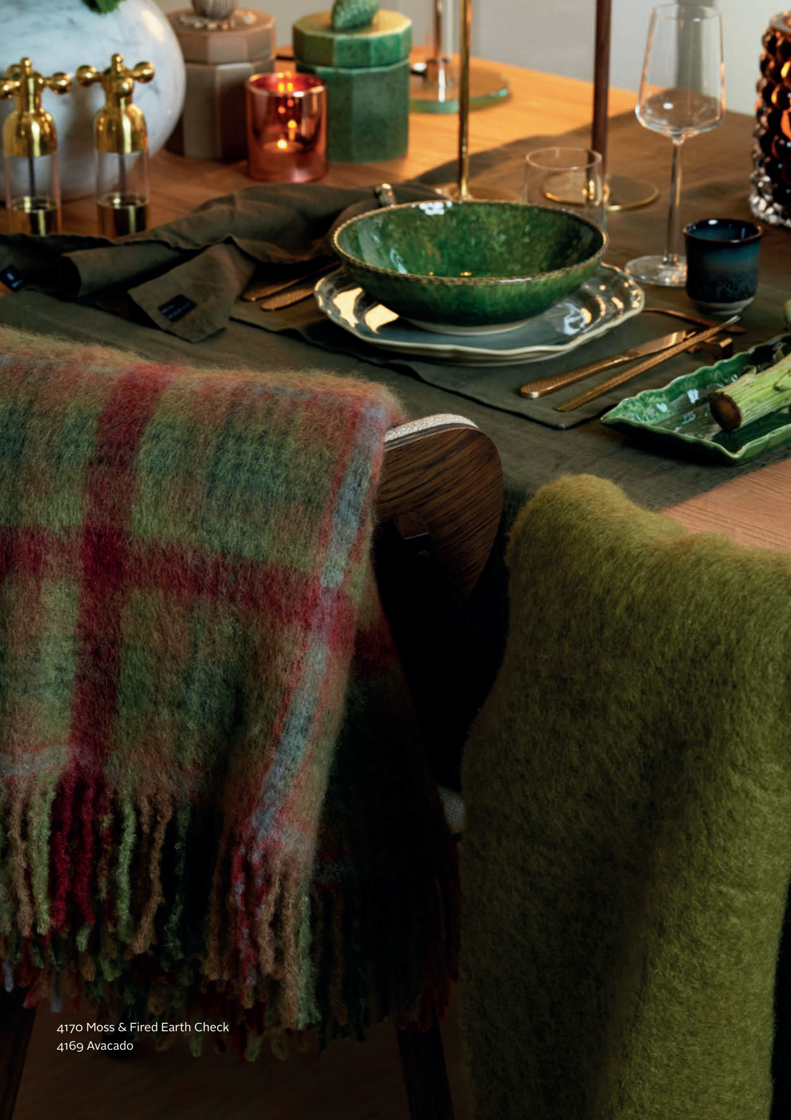
4170 Moss & Fired Earth Check 4169 Avacado