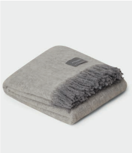
4042 Mohair Blanket White & Skiffer Melange