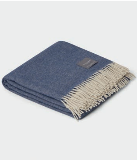
5040 Recycled Blanket Blue