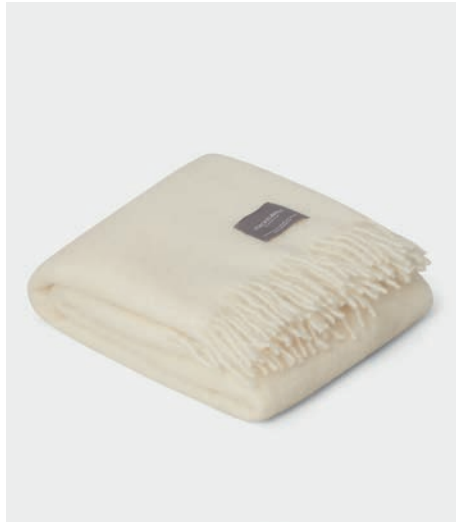
4142 Mohair Blanket Bright White