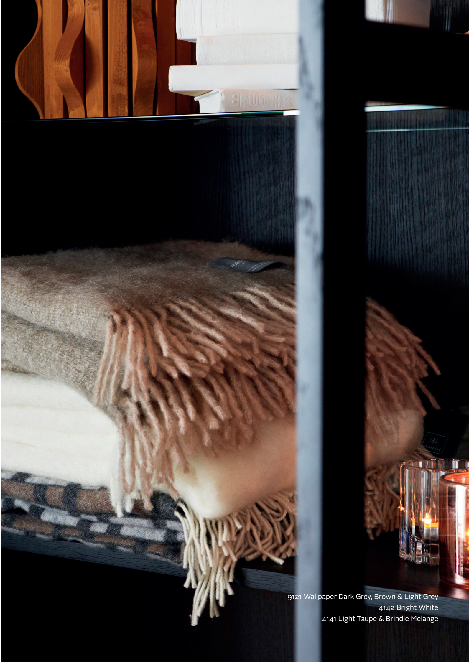
9121 Wallpaper Dark Grey, Brown & Light Grey 4142 Bright White 4141 Light Taupe & Brindle Melange