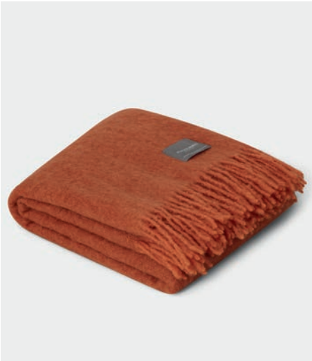
4148 Mohair Blanket Rusty & Terracotta Melange