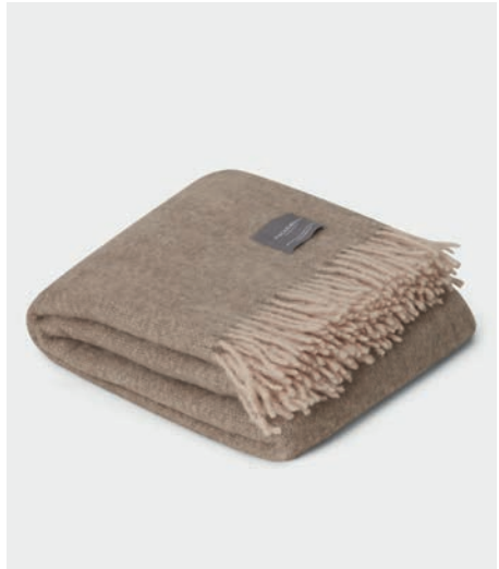
4141 Mohair Blanket Light Taupe & Brindle Melange