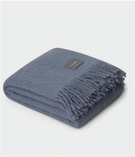
4013 Mohair Blanket Pilaster