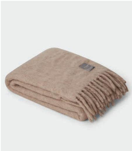
4107 Luxury Kid Mohair Blanket Light Taupe

Luxury Kid Mohair Blanket is made of 80% Kid Mohair, 15% Wool and 5% Nylon binding. Size: 140 x 230 cm.