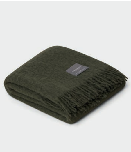
4035 Mohair Blanket Moss