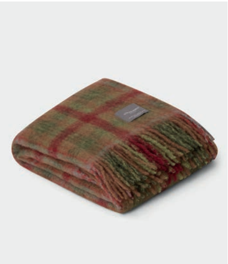
4170 Mohair Blanket Moss & Fired Earth Check