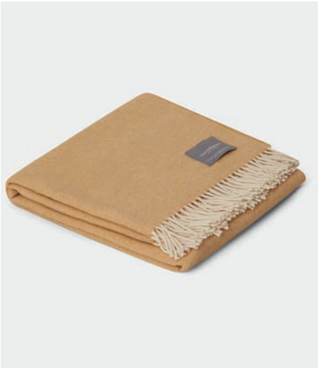
5045 Recycled Blanket Mustard