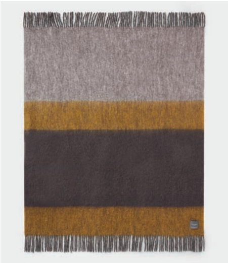
4155 Mohair Blanket Mustard & Charcoal Stripe Pattern