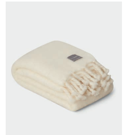
4203 Mohair Deluxe Blanket White