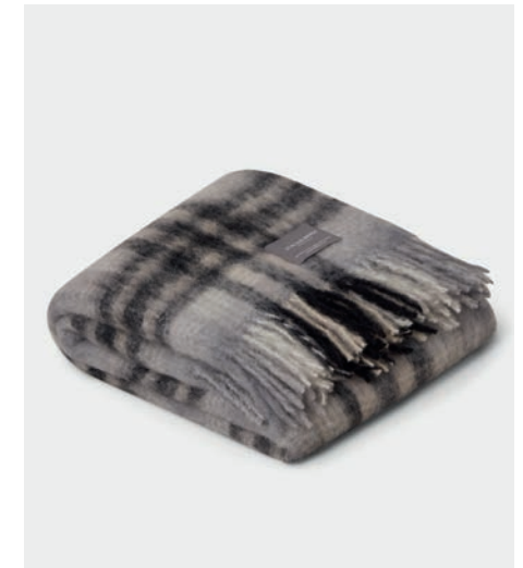
4173 Mohair Blanket Black, Skiffer & White Check