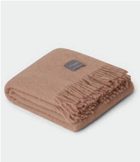
4171 Mohair Blanket Naturals