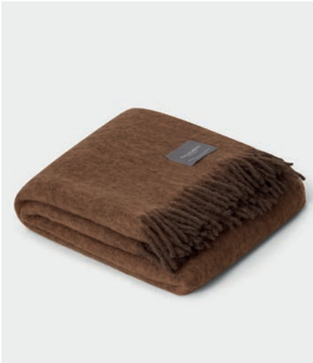
4153 Mohair Blanket Dark Earth Light Brown Melange