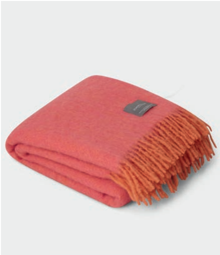
4006 Mohair Blanket Orange & Pion Melange