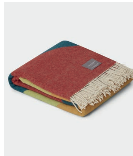
9117 Wave Blanket Lime, Ocra, Petrol & Wine Waves

Wallpaper & Wave Blanket are made of 70% Recycled Wool, 27% Polyamide and 3% Other Fibre. Size 140 x 180 cm. Wallpaper and Wave Blankets are designed by the architect & design company Egnell & Allard and manufactured by Stackelbergs in Italy.