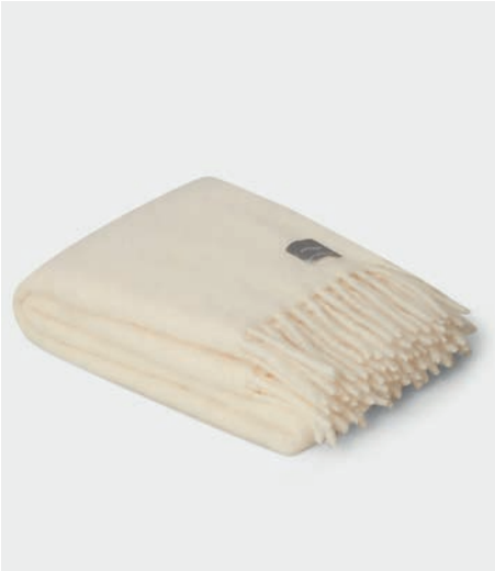
4100 Luxury Kid Mohair Blanket Pure White