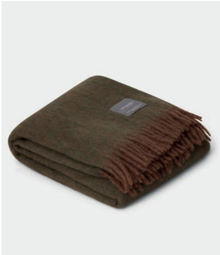
4150 Mohair Blanket Umbra & Moss Melange