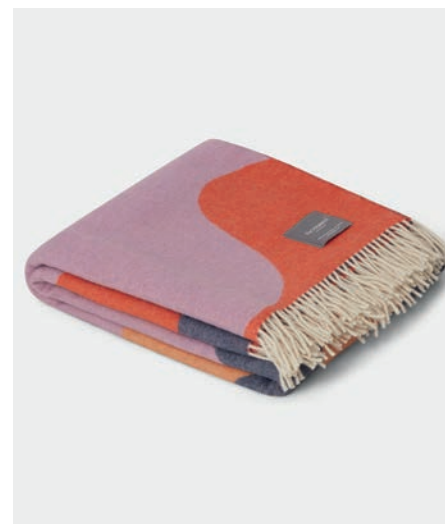
9116 Wave Blanket Coral, Ocra, Blue & Lilac Waves