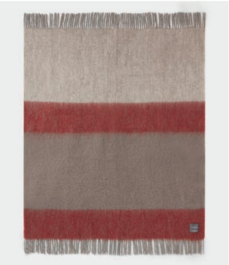
4154 Mohair Blanket Brick & Brindle Stripe Pattern