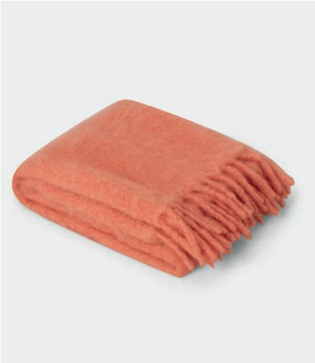
4201 Luxury Kid Mohair Blanket Salsa