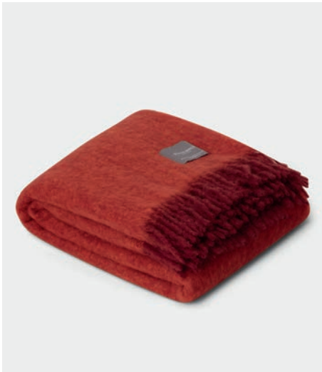
4167 Mohair Blanket Fired Earth & Jaffa Melange