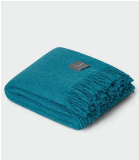
4068 Mohair Blanket Emerald