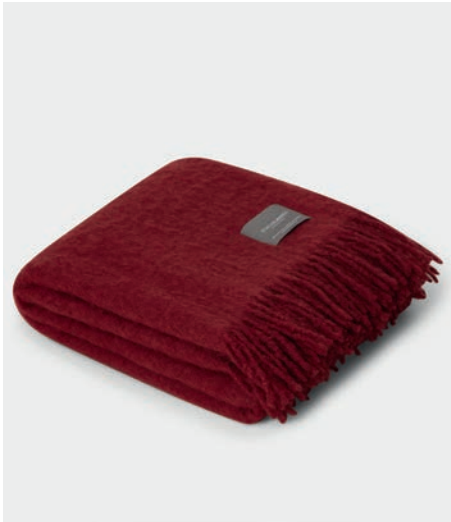
4147 Mohair Blanket Fired Earth