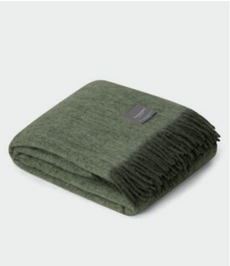
4117 Mohair Blanket Moss & Green Melange