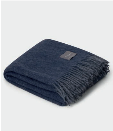
4122 Mohair Blanket Tide & Marin Melange