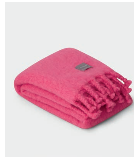
4200 Mohair Deluxe Blanket Pion

Deluxe Mohair Blanket is made from 88% Mohair, 8% Wool and 4% Nylon binding. Size: 140 x 220 cm.