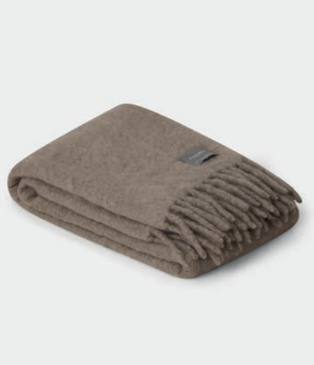
4109 Luxury Kid Mohair Blanket Brindle