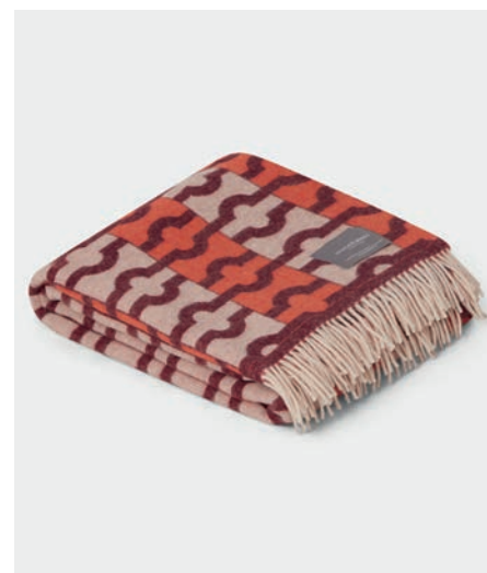
9120 Wallpaper Blanket Orange, Bordeaux & Offwhite