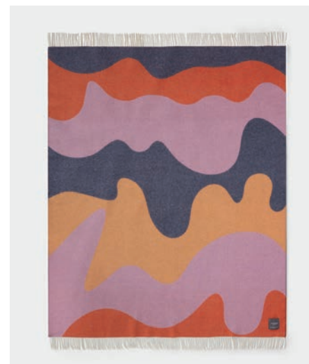
9116 Wave Blanket Coral, Ocra, Blue & Lilac Waves Pattern