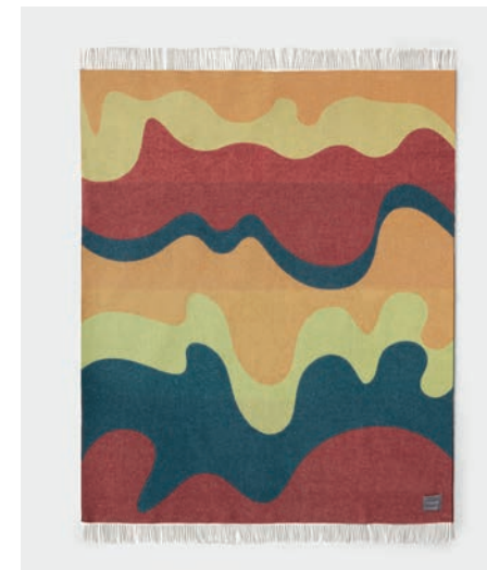
9117 Wave Blanket Lime, Ocra, Petrol & Wine Waves Pattern