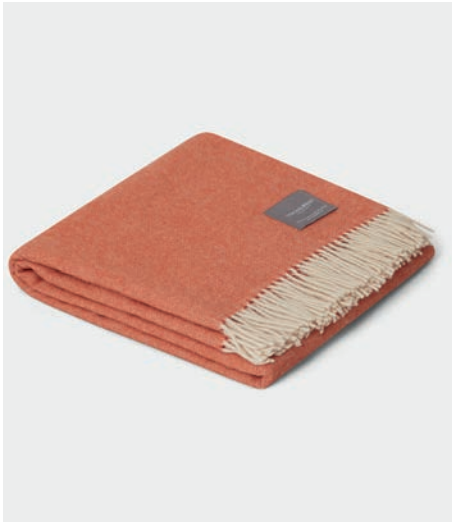
5046 Recycled Blanket Orange

Our wool blankets in a classic herringbone pattern in recycled wool with the same high demands on quality and green profile. The products are made in Italy and consist of 75% Recycled Wool, 20% Polyamide, 5% Other Fibre. All plaids are in size 130 x 170 cm. Can be machine washed in wool program max 30 degrees or dry clean.