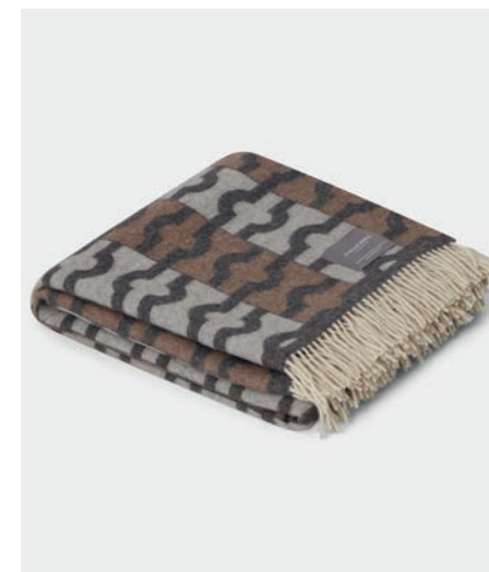
9121 Wallpaper Blanket Dark Grey, Brown & Light Grey