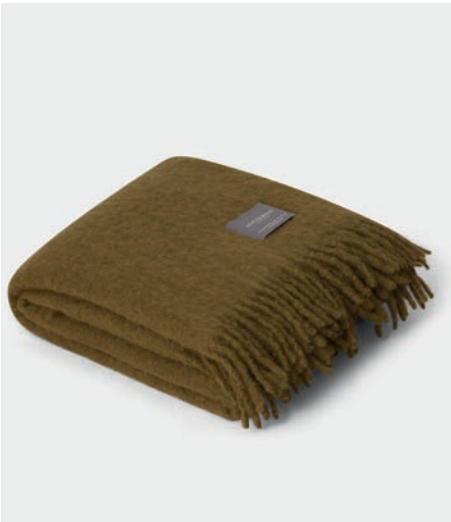
4169 Mohair Blanket Avacado