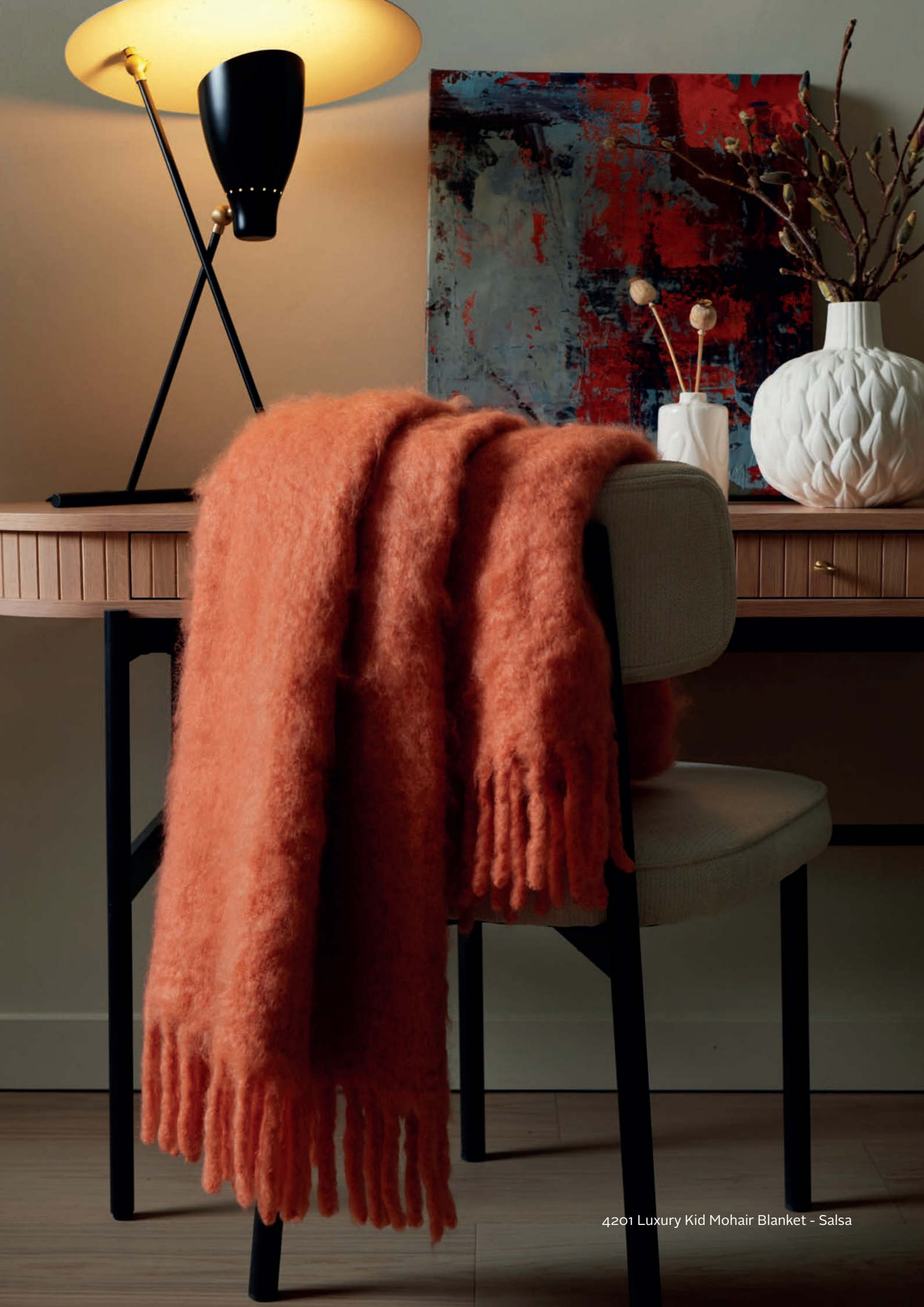
4201 Luxury Kid Mohair Blanket - Salsa